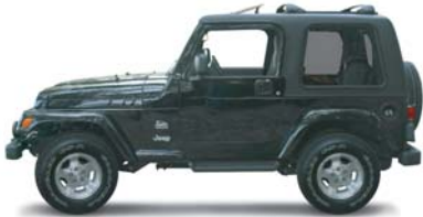
Jeep Wrangler 1-Piece