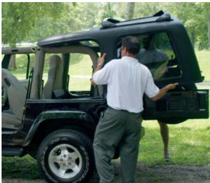
Bull Dawg tops are easy to install and remove.